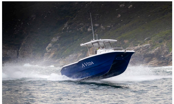
MAGNUM 2750 CENTRE CONSOLE