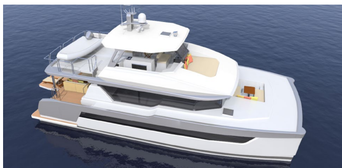
TWO OCEANS 55 POWER CATAMARAN

They are robust yet luxurious, comfortable and functional for living aboard. Powerful and fuel-efficient engines provide the capability to motor long distances across oceans.