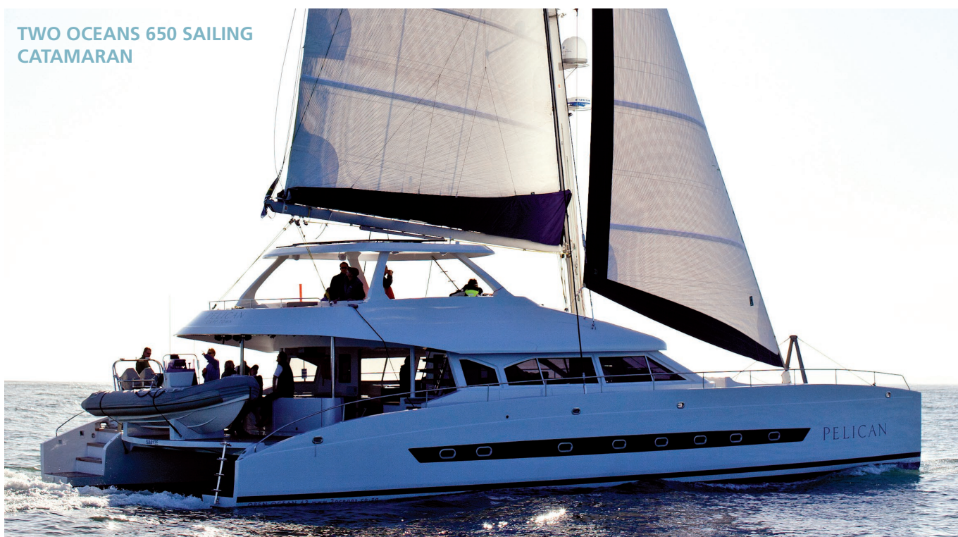
TWO OCEANS 650 SAILING CATAMARAN