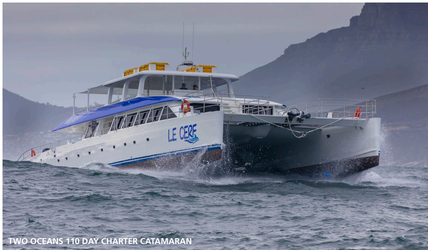
TWO OCEANS 110 DAY CHARTER CATAMARAN