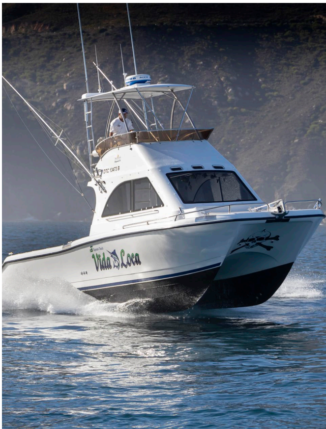
MAGNUM 36 WALKAROUND