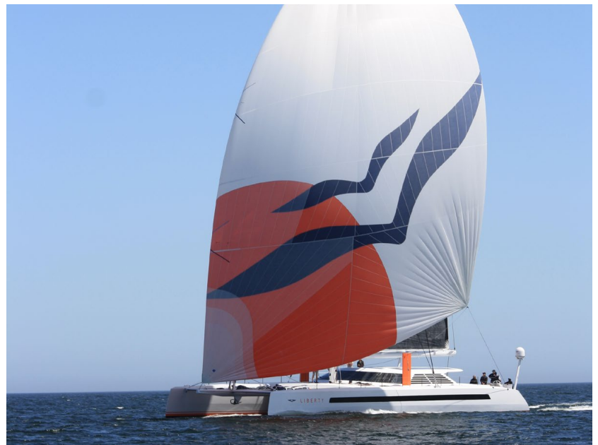
TWO OCEANS 82 HPC HIGH PERFORMANCE SAILING CATAMARAN