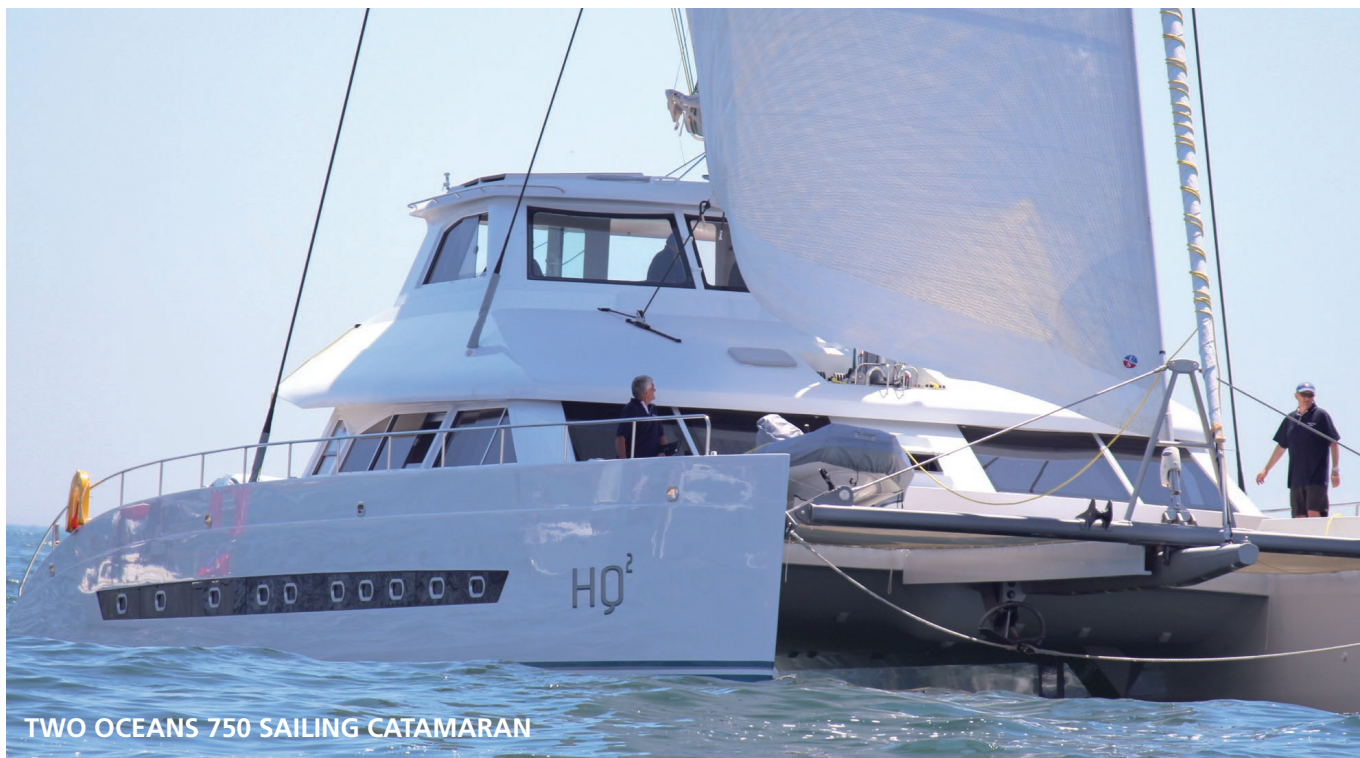
TWO OCEANS 750 SAILING CATAMARAN