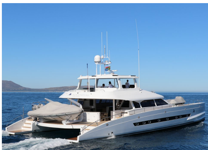
TWO OCEANS 750 E POWER CATAMARAN