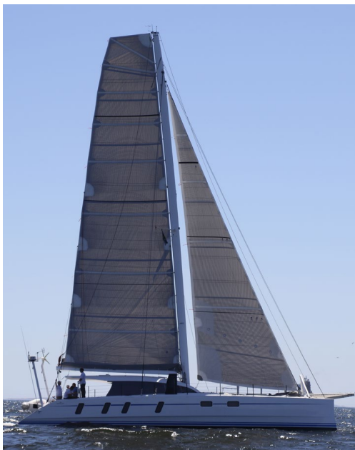
TWO OCEANS 60 FULL CARBON HIGH PERFORMANCE SAILING CATAMARAN