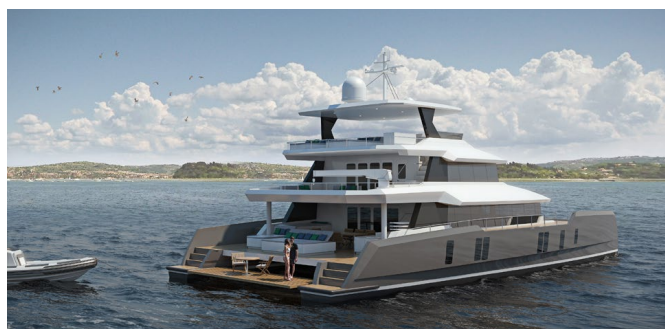
TWO OCEANS 870 POWER CATAMARAN