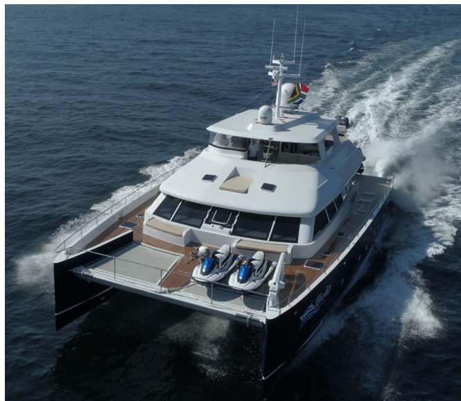
TWO OCEANS 850E POWER CATAMARAN