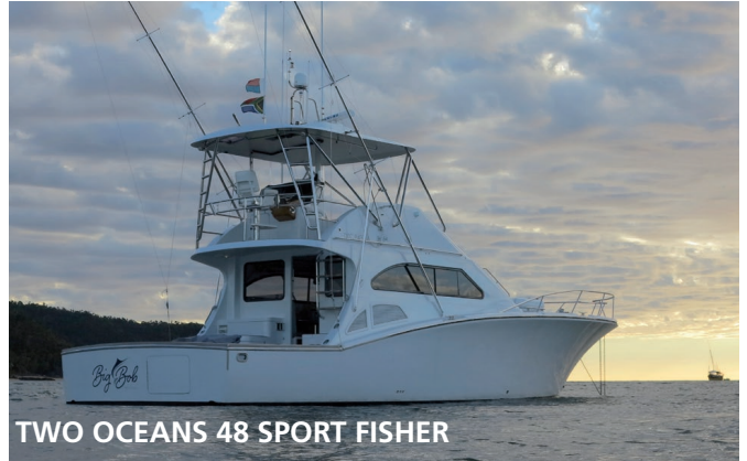
TWO OCEANS 48 SPORT FISHER

Two Oceans Marine Manufacturing spearheaded the introduction of power catamarans to the Cape Town market. Today, the local tuna fishing fleet consists almost exclusively of power catamarans. The Magnum Power Catamaran Range from Two Oceans Marine has many custom leisure and commercial applications. Built to withstand the rough seas in Cape Town, the Magnum Range is stable, robust, comfortable, functional – and highly customisable.