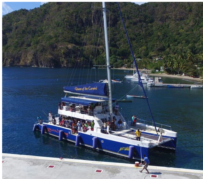
TWO OCEANS 690 DAY CHARTER SAILING CATAMARAN