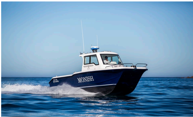
MAGNUM 2750 WALKAROUND