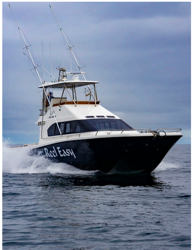
MAGNUM 46 WALKAROUND