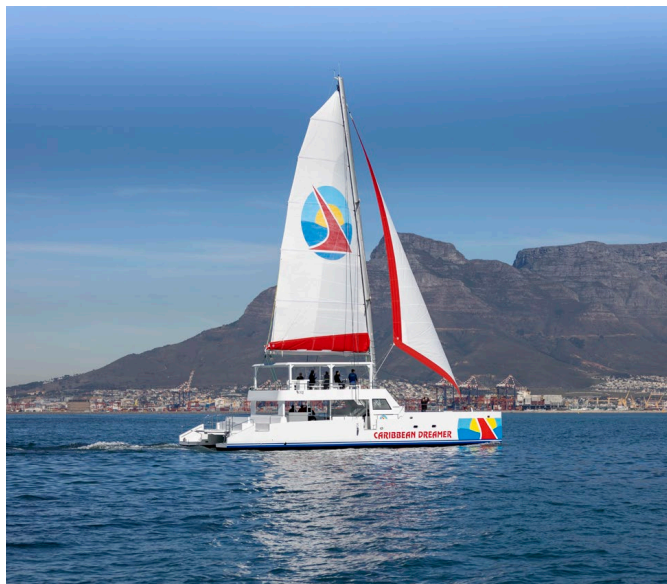
TWO OCEANS 700 DAY CHARTER SAILING CATAMARAN

Recent sailing day charter launches from Two Oceans Marine Manufacturing include the Two Oceans 690 and 700 Charter Sailing Catamarans. On the power side, In 2019, Two Oceans Marine launched the largest composite catamaran ever launched in South Africa: the Two Oceans 110 Day Charter Sailing Catamaran. This vessel is capable of hosting large functions and events and can carry up to 275 people on an upper and lower level, complete with a dance floor.