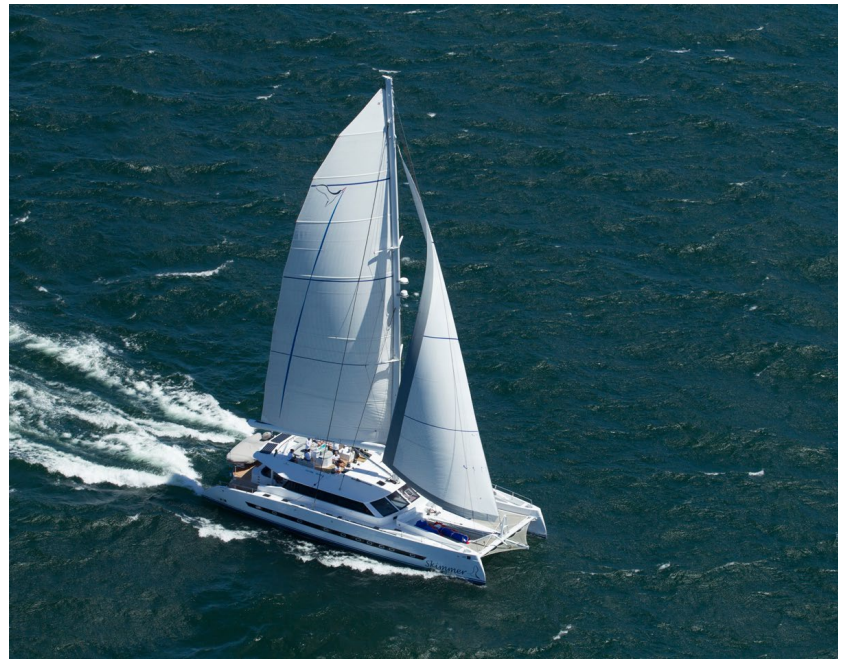
TWO OCEANS 740 PERFORMANCE CRUISING CATAMARAN